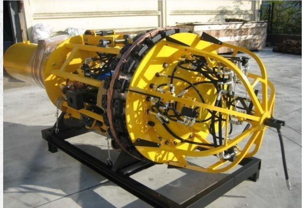
OPUS Pipe Internal Clamp